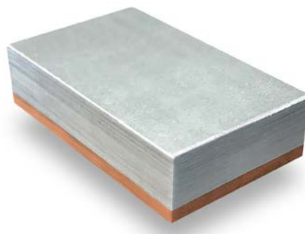
Left: Aluminium to copper bars